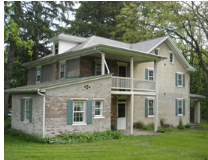
House of Prayer

https://www.lutherancamping.org/the-wittel-farm/